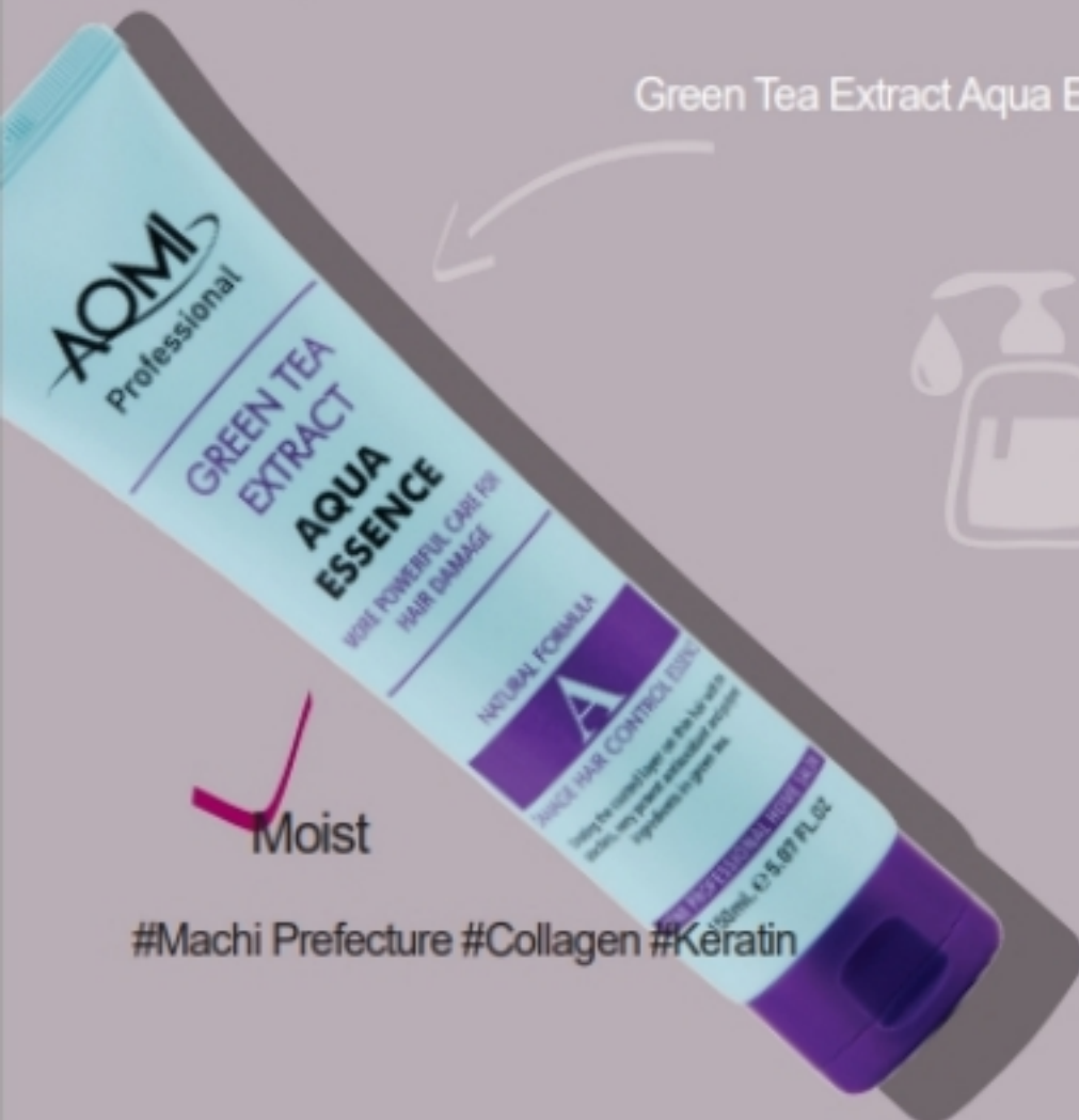
Green Tea Extract Aqua Essence