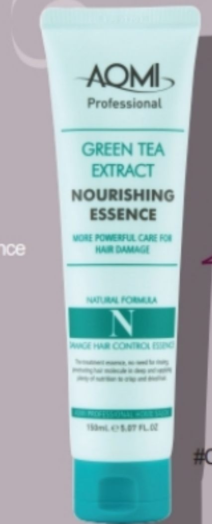
Green tea essence nourishing essence

#Central grass #Eoseongcho #Golden #Citrus scent