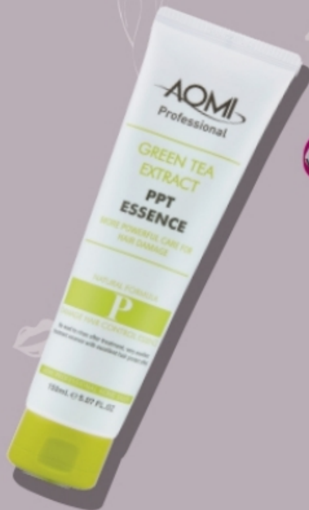
Green Tea Extract PPT Essence