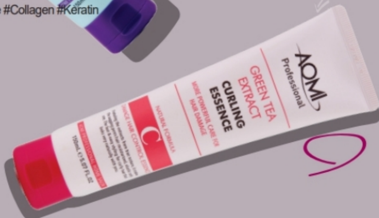
Green Tea Essence Curling Essence